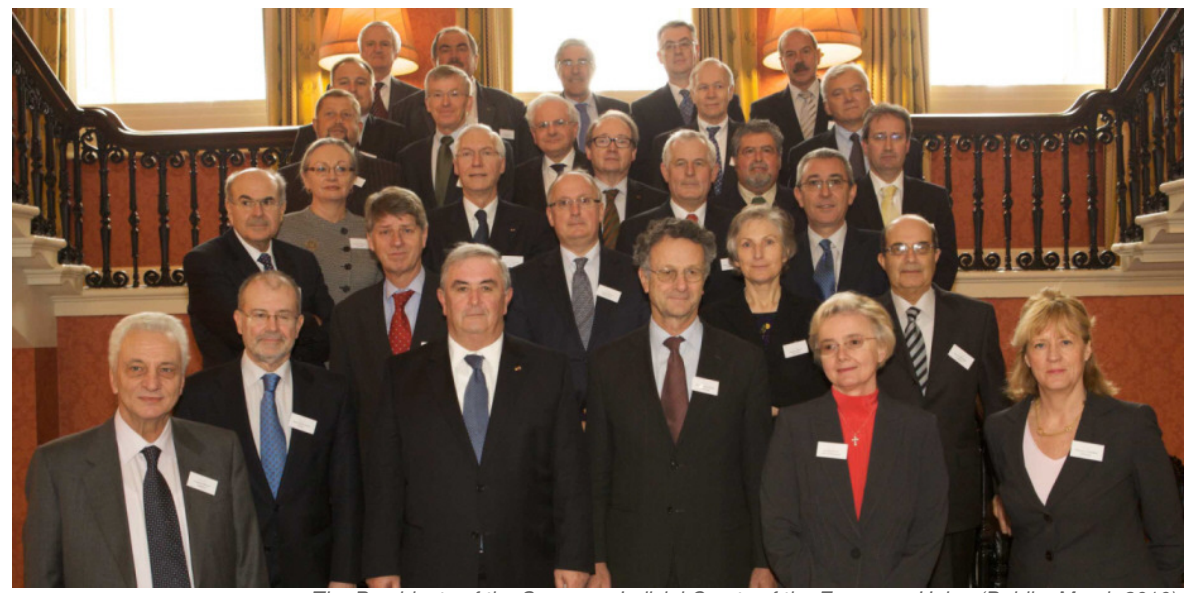
The Presidents of the Supreme Judicial Courts of the European Union (Dublin, March 2010)

This Newsletter publishes a summary analysis of the various approaches to legal aid in the EU countries, a comparative study compiled on the basis of the replies received from the supreme courts by the Legal Aid Office of the French Cour de cassation . The next issue of our Newsletter will be devoted to the Colloquium held by our Network in Dublin on 19 March 2010 on the practical aspects of the independence of justice.